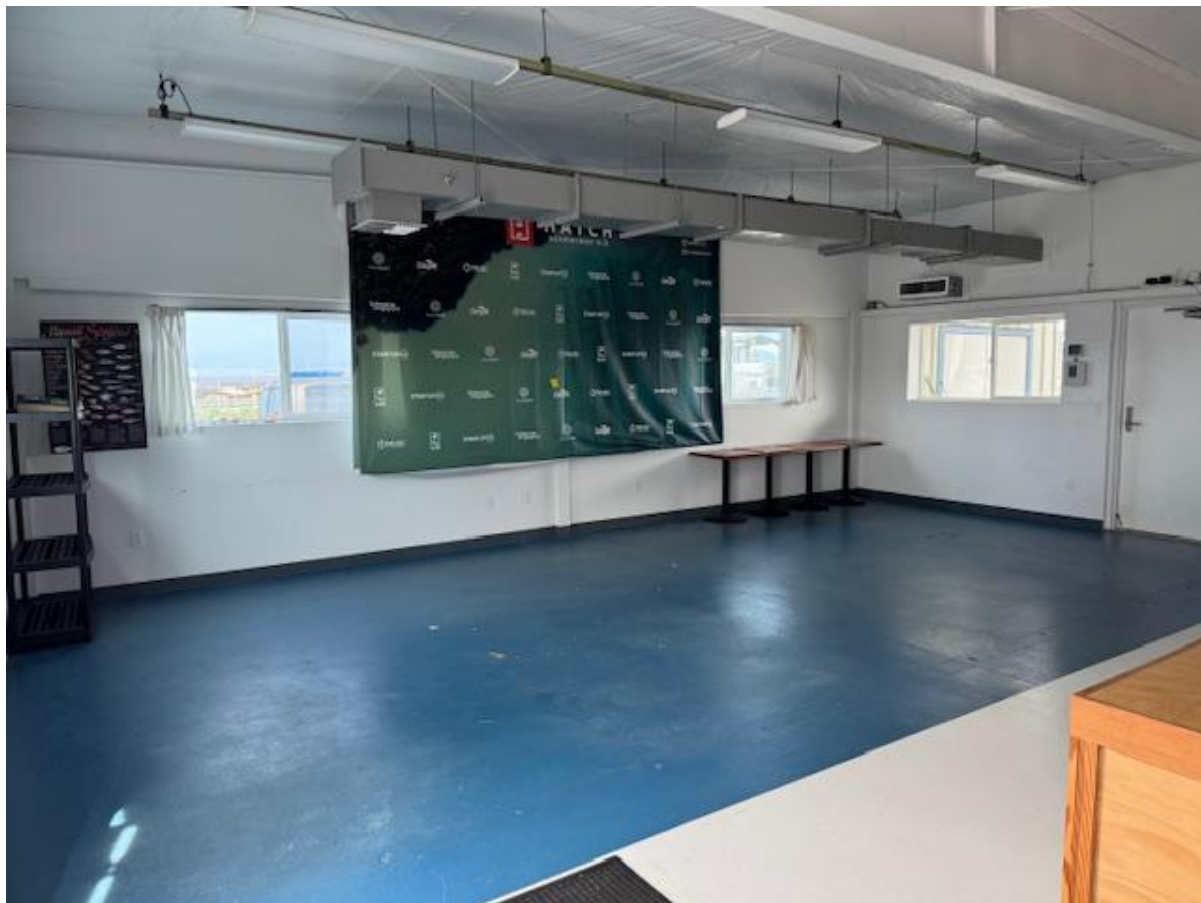
West side of Hale Kaa incubator space where pods will be located.

Bidder shall provide specifications along with the price quote. The full specification list will allow NELHA to evaluate whether the proposed pod is suitable for the incubator space it will be placed in. In particular, quotes must include exact dimensions for the pods.